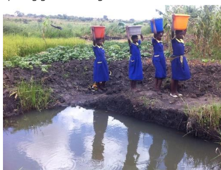
carring water more than 4 miles