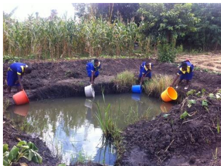
young girls fetching cleanest available water