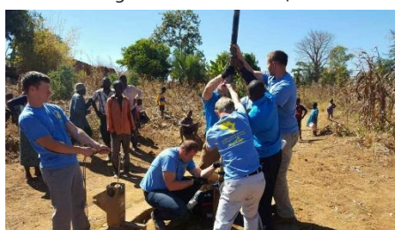
repairing water well in remote village

If you would like to find out how you can be involved in this life changing ministry, please visit us at: